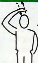
Illegal receiver down field on pass