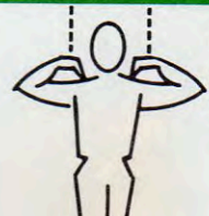
Illegal touching of kicked or free ball.