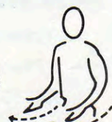
Crawling, pushing, or helping runner