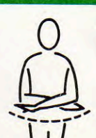
Penalty refused, incomplete pass.