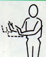
Interference with forward pass.