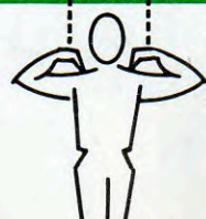
Illegal touching of kicked or free ball.