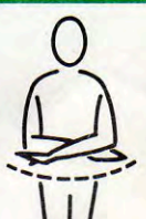
Penalty refused, incomplete pass.