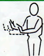
Interference with forward pass.